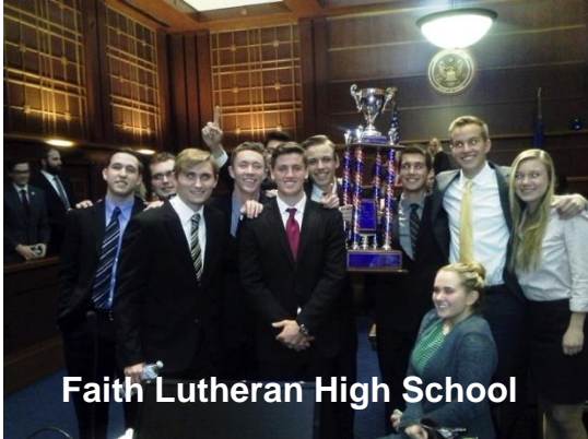
Faith Lutheran High School

The Nevada state finals had 8 teams compete at the State Competition held in the Bruce Thompson Federal Courthouse March 6 th and March 7 th 2015 in Reno, Nevada. The teams were: