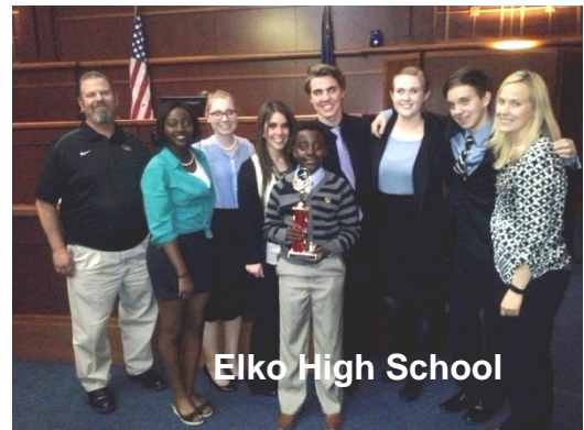
Elko High School

There were a total of four rounds plus the Championship round. Elko High School came in a close second to Faith Lutheran High School. Faith Lutheran High School will be representing Nevada at the National Mock Trial Competition in May in North Carolina.