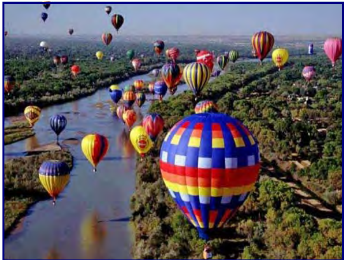
Albuquerque International Balloon Fiesta