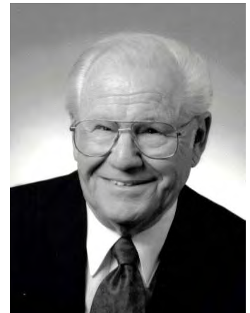
The Hon. Gene E. Franchini 1935–2009

The 2012 Nationals will be headquartered at the recently-remodeled Hyatt Regency Hotel in downtown Albuquerque. Rooms at the Hyatt will be for competing teams only . Parents, judges, and others will be housed at the also recently-renovated DoubleTree Hotel , which is about two blocks from the Hyatt and an equal distance to the Courthouses. The downtown area is easily accessible from the Albuquerque International Sunport by shuttle, taxi or rental car.