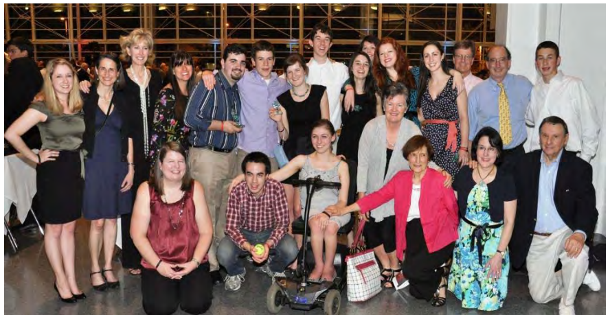
Seattle Prep Mock Trial Team after 2011 NHSMTTC in Phoenix, AZ

I have often been asked why I spend so much of my time on Mock Trial. Some people do not understand why reading, writing, rewriting, practicing, rewriting and performing in a mock court setting is fun. To be honest, it is not simply the reading, writing or performing that is fun; it is the people. I know it sounds cheesy, but my team, coaches and teachers are some of my favorite people to spend my time with - arguing over whose side of the case is really right, spending weekends huddled over a table working on the last question of a cross, or laughing at a Mock Trial joke that probably is not really funny. (continued on next page...)