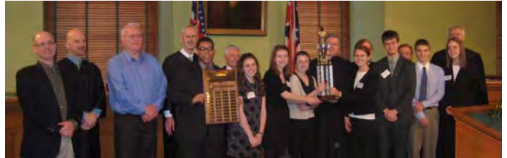
Archbishop Hoban High School mock trial team (Ohio)

access the Championship Round anytime on the web by going to www.ocltre.org and following the link for the High School Mock Trial Championship Round. Additionally, the Ohio Center for Law-Related Education is now on Facebook : become a fan!