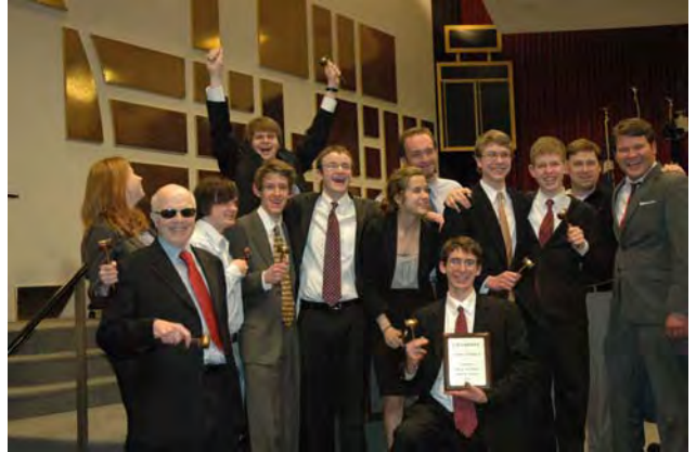
John Adams High School Mock Trial Team (Indiana)