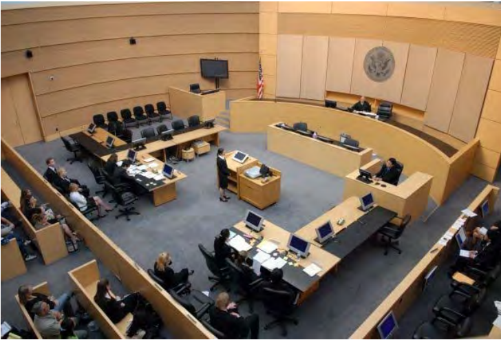
The Special Proceedings Courtroom in the United States District Courthouse will be the venue for the 2011 National Championship Round.

The Superior Court will be open to the public on Friday, and full security will be in effect on both Friday and Saturday. Everyone will have to remove their belts and pass through a metal detector, and all belongings will have to be scanned. We are working with the Superior Court to make this process go as smoothly and quickly as possible, and we ask for everyone's cooperation with this process. More information regarding courthouse security is available in the Handbook, and additional information will be provided as we get closer to the Championship.